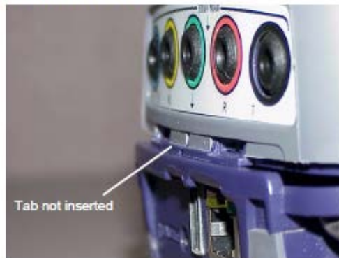
Figure 10 Incorrect SIM attachment

You should be able to feel that the SIM tab is inserted correctly, as you cannot push the SIM forward. Figure 10 shows an incorrect insertion.