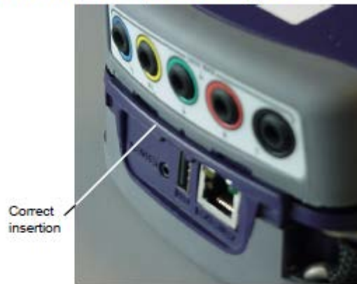
Figure 9 Inserting the SIM tab

You should be able to feel that the SIM tab is inserted correctly, as you cannot push the SIM forward. Figure 10 shows an incorrect insertion.